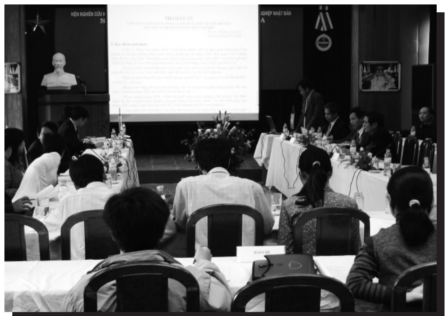
Overseas seminar in Hanoi, Vietnam

To promote industrial safety and health measures among companies beginning operations outside Japan and for Japanese workers on overseas assignments, JISHA holds Seminars on Industrial Safety and Health Management for those working for Japanese companies in several Asian countries. When conducting these seminars, JISHA strives to provide training that meets the needs of the host country and to strengthen its