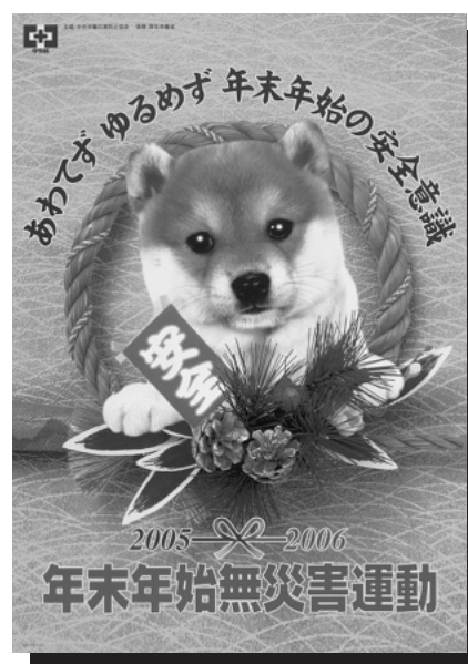
2005 Year-End and New Year Zero-Accident Slogan poster

The Year-End and New Year Zero-Accident Campaign is held in workplaces nationwide by JISHA with the support of the Ministry of Health, Labour and Welfare (MHLW) for the purpose of preventing the occupational accidents that tend to