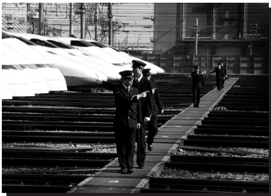
Gold prize winning photograph

occur frequently around the year-end and New Year period.