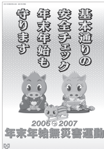
Year-End and New Year Zero-Accident Campaign poster

2006 Year-End and New Year Zero-Accident Campaign slogan Fundamental safety checks: stay protected during the New Year’s season (three other entries received honorable mention)