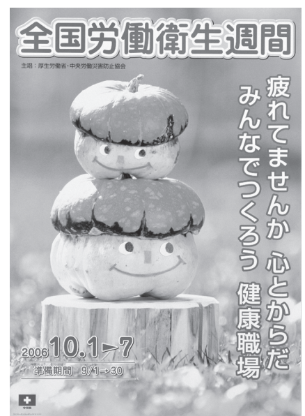
National Occupational Health Week poster