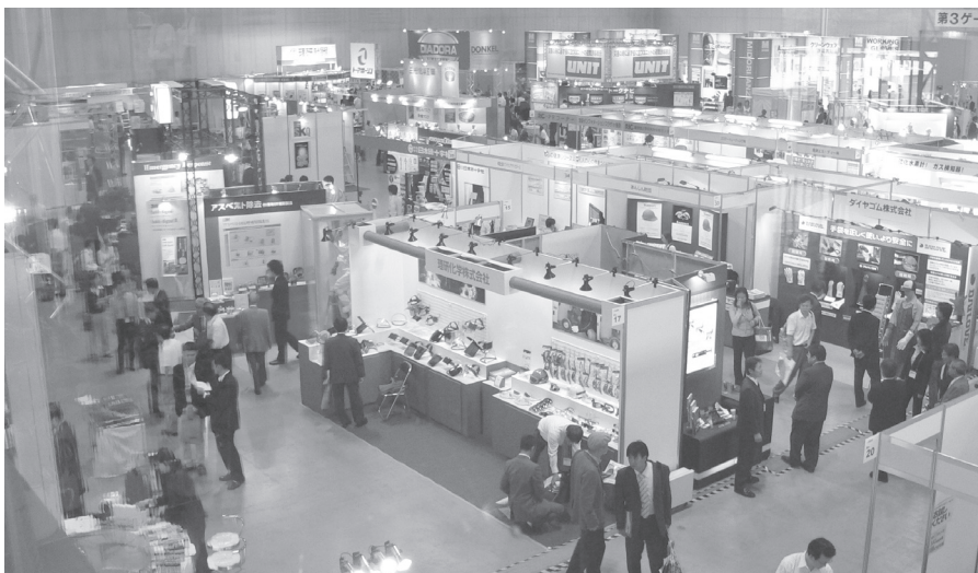
Green Cross Exhibition

The 57th Week’s slogan was “Feeling tired? Working together to create physically and mentally healthy workplaces.” During this week, efforts are made to raise awareness of