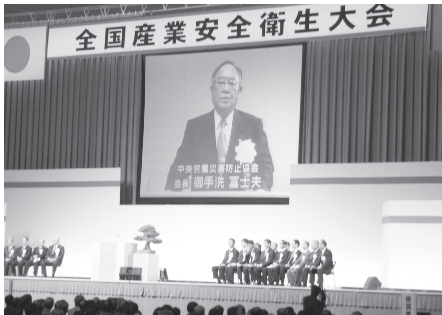
Plenary Session of the Convention